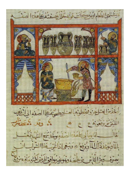
Arabic translation of the Materia Medica of Dioscorides

In addition to this list of specialized works, there are the books on poisons that list various recipes of antidotes from the simplest to the most complex. The small or great theriacs are the most notable examples<sup>10</sup>. There is not a single drafting model. The classification is diversified, either according to the organ studied, or according to the therapeutic form described. Some of these books are clearly identifiable by their title ( al-aqrābāqīn al-kabīr , the great formulary), others are more discreet about their content ( kitāb al-wisād fī al-ṭibb, the book of the pillow on medicine ) and others, as the muǧarrabāt , adopt a particular angle of view. Finally, the medical encyclopædias include generally a pharmacopeia.